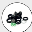
O Ring Kit