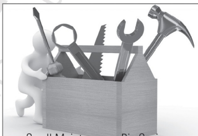
Small Maintenance. Big Savings.