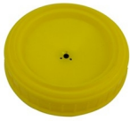
AM CHAMPION-01 Tank cap