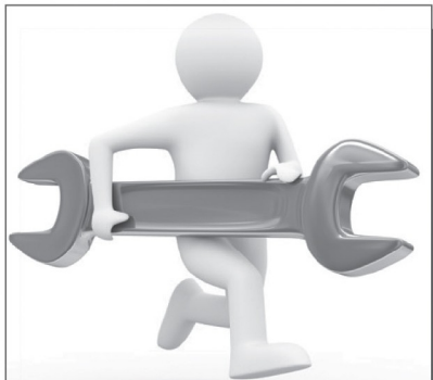
Small Maintenance. Big Savings.