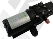
AM CHAMPION-08 Auto pump