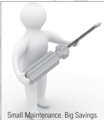
Small Maintenance. Big Savings.