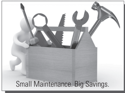
Small Maintenance. Big Savings.