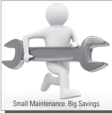
Small Maintenance. Big Savings.