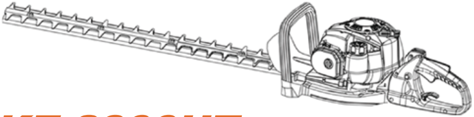
DIAGRAM & SPARE PARTS